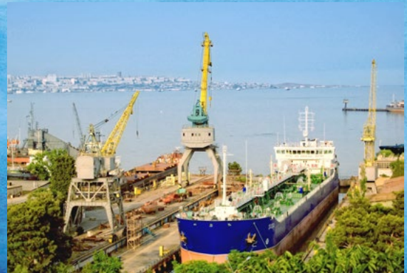
"The philosophy of logistics is to provide larger volumes of cargo with less transport means" Akif, Azerbaijan

Investing in People Much of the work done by projects focuses on building peoples' capabilities, through workshops, for example. There is also much activity on issues that improve society and living conditions. At the end of the day, though, it is all a matter of investing in the citizens, locally, through EU-funded cooperation activities. Regional cooperation is mainly funded through the financial arm of the European Neighbourhood Policy (ENP), the European Neighbourhood and Partnership Instrument (ENPI), replaced by the European Neighbourhood Instrument (ENI) in 2014.