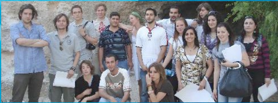
"Youth have been overlooked by politicians" Qurie, Jordan

As a result of a better cooperation in specific sector areas, the ENP is more and more influencing people's life in a positive and concrete way. Projects supported by the EU and related to transport, environment, education and energy, among many others, are improving daily living conditions in partner countries.