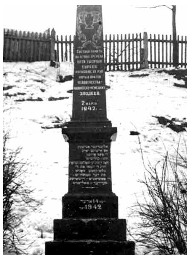
Memorial Holocaust Stone erected in 1947 in 'Jama'. Minsk.