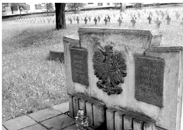
Polish Monument at Hrodna cemetery.