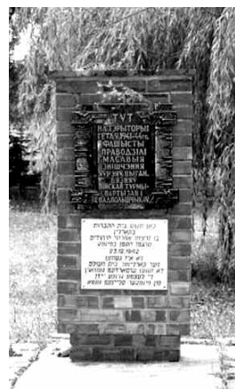
Roma and Jewish Holocaust Monument in Pinsk.