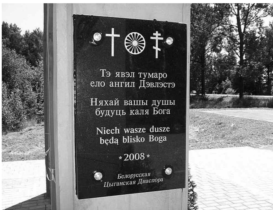
Roma Memorial in Kaldyčava. Baranavičy district.