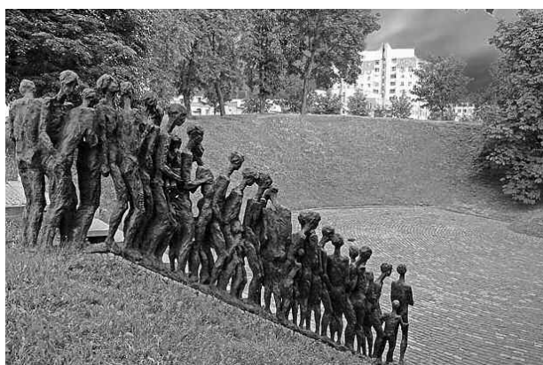
Memorial 'Jama' erected in 2008. Minsk.