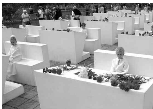
Memorial 'Krasny Bierah' opened in 2007 in Homiel region. Fragment.