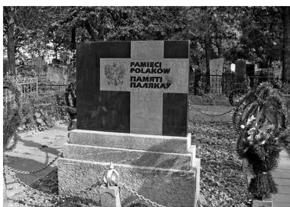
Polish Monument in Baranavičy.