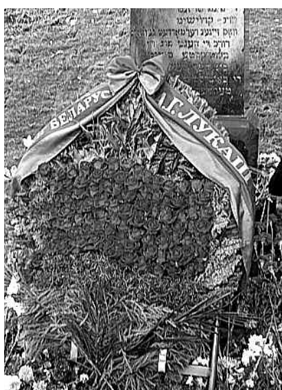
Memorial Wreath from President Aliaksandr Lukašenka to the commemoration of the victims of Holocaust in Belarus.